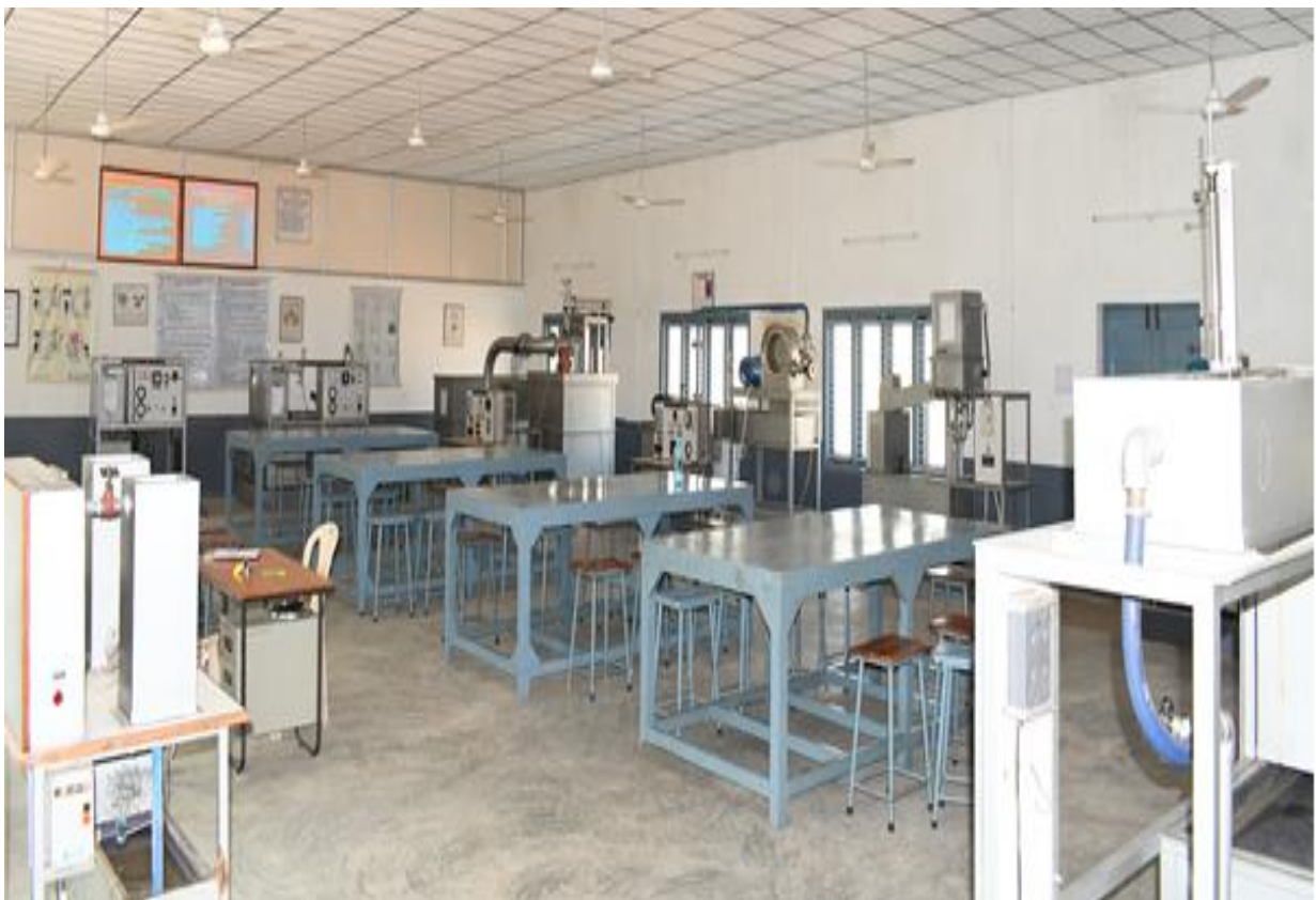
Over view of Fluid Mechanics and Hydraulic Machinery Lab